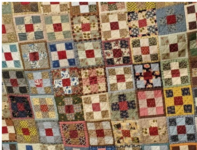
Civil War "Cot" Quilts